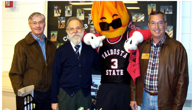
The Rotary clubs of Valdosta, Valdosta North, and Valdosta Sunrise are working with the Ferst Foundation and the Dolly Parton Foundation to raise money for books for pre-school children in Lowndes County. Children enrolled in the program receive an Imagination Library book - from The Little Engine that Could to Look Out Kindergarten, Here I Come - each month until age five.